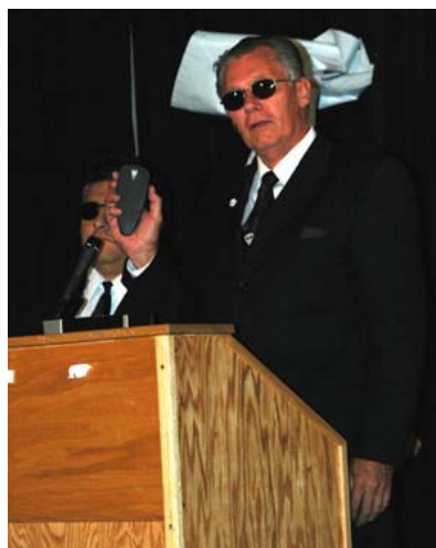
The Men in Black then came and erased everyone's memories.

These pictures and more will be posted on the website soon. www.comufon.org